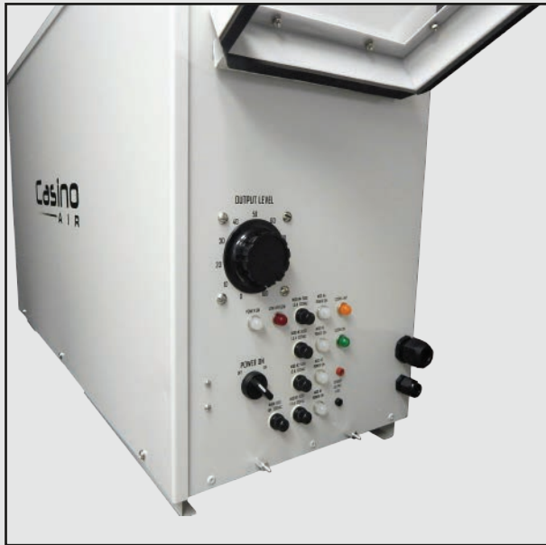
Casino Air vs. Bi-polar Ionization